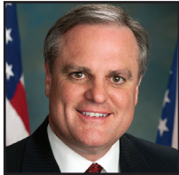
Sen. Mark Pryor (AR-D)