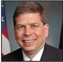
Sen. Mark Begich (AK-D)