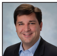
Sen. David Rouzer (NC-R)

2012's closest campaign was found in southeast North Carolina. The result allowed Rep. Mike McIntyre (D) to win re-election by just 654 votes from more than 336,000 ballots cast. We're likely to see a re-match here, as former state Sen. David Rouzer (R) is already gearing up a campaign. The lower mid-term turnout model should play strongly to Rouzer's favor. This is a prime Republican conversion opportunity.