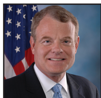
Rep. Mike McIntyre (NC-D)