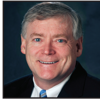
Lt. Gov. Mead Treadwell (AK-R)

Sen. Mark Begich (D) stands for a second term in what is generally a Republican state. Expect the healthcare issue to dominate the campaign agenda, as the Senator