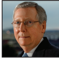
Sen. Mitch McConnell (KY-R)