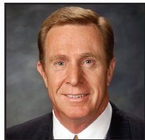
Rep. Gary Miller (CA-R)