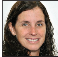
Martha McSally (AZ-R)

When Rep. Gabrielle Giffords (D) was tragically shot at the beginning of 2011 while performing constituent duties, her former staff aide, who