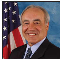
Rep. Joe Baca (CA-D)

In 2011, redistricting drew Orange County Rep. Gary Miller (R) into a brand new San Bernardino County seat. He still managed to win a substantial