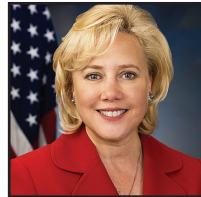
Sen. Mary Landrieu (LA-D)