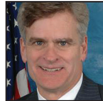
Rep. Bill Cassidy (LA-R)

Sen. Mary Landrieu (D) is on the political hot seat in Cajun Country, as she strives to win a fourth term next year. Her chief opponent is Baton Rouge