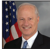
Rep. Mike Coffman (CO-R)