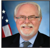
Rep. Ron Barber (AZ-D)