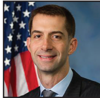
Rep. Tom Cotton (AR-R)

This may be the power race of the cycle. Two-term Sen. Mark Pryor (D) runs for a third term in an increasingly Republican state. He will face Rep Tom Cotton (R),